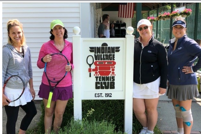
Women's A Finalists