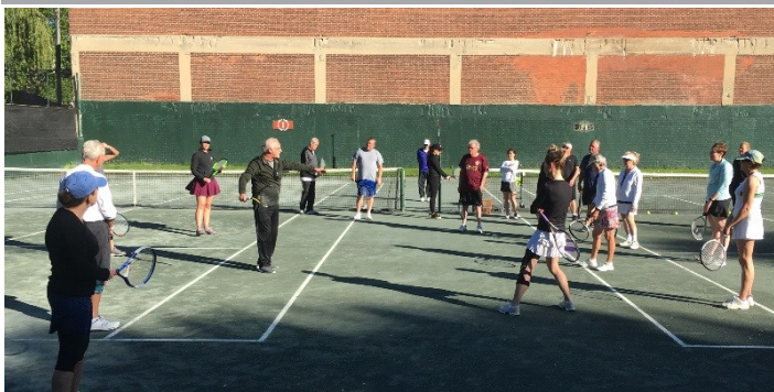
First Monday Night Lesson and Drill