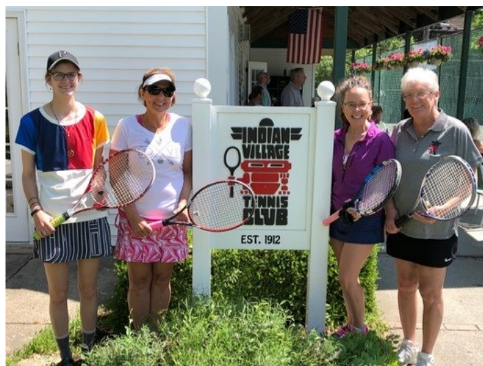
Women's B Finalists