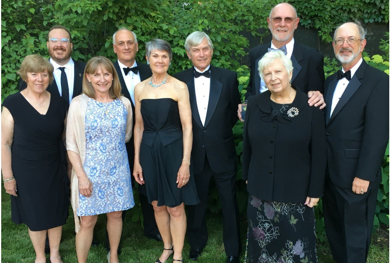
Presidents of IVTC