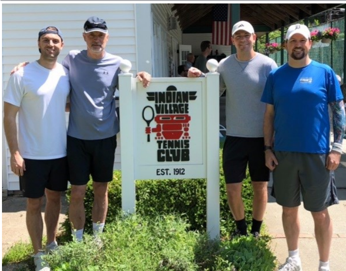
Men's A Finalists