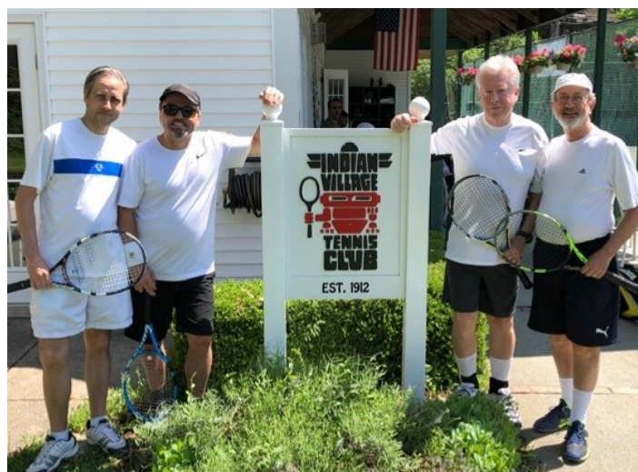
Men's B Finalists