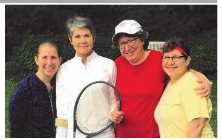
Women's A finalists

It was nice to see both a Women's A & Women's B draws this year. Each draw included a variety of different finalists (not repeats from last year). In the "B" Final, "Team Greece"