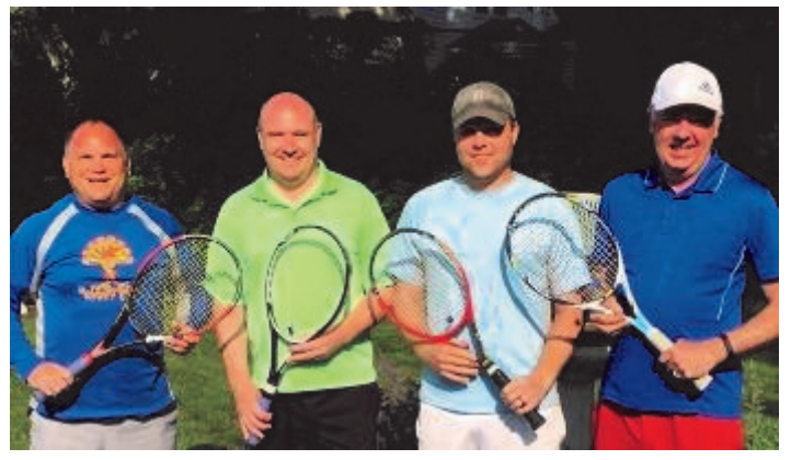
Men's B finalists