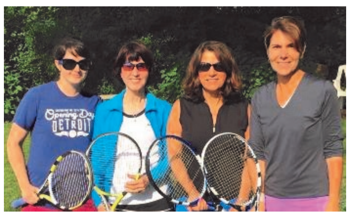
Women's B finalists